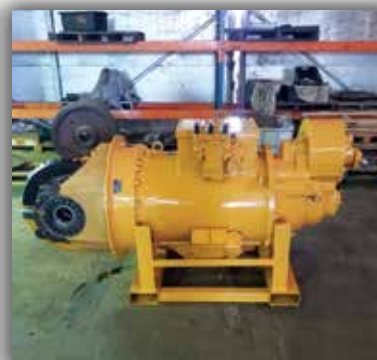
Transmission being tested and adjusted on the dyno. Completed 793 transmission and diff assembly tested and QA'd