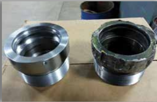
Hydraulic cylinder gland nut