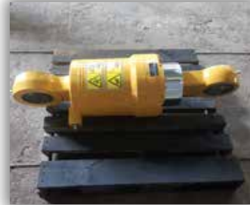
Cylinders, 789 rear suspension cylinder