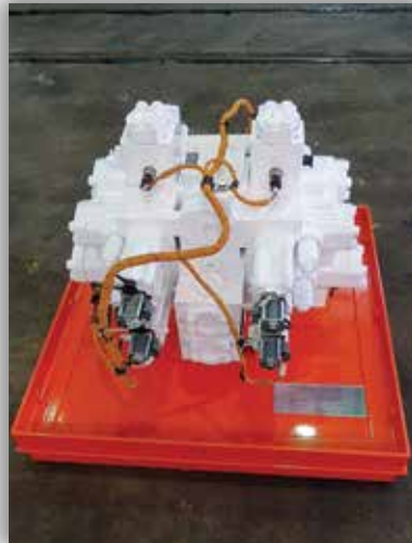
CAT 993 Control valve