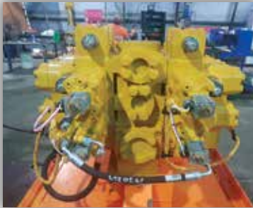
992K control valve

QUALITY COMPONENTS IN ACCORDANCE WITH OEM GUIDELINES AND AUSTRALIAN STANDARDS.