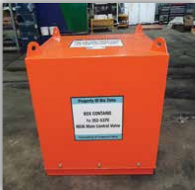
Certified transport stand