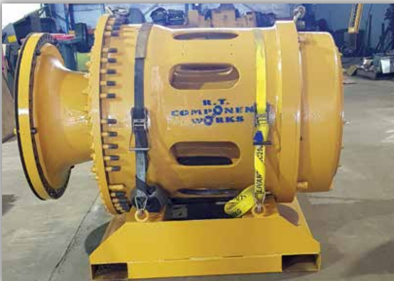
CAT 789 final drive