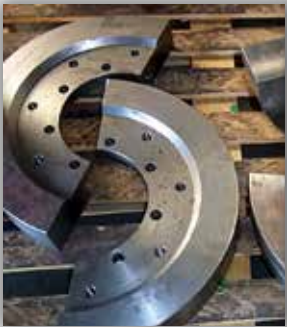
Abon feeder shaft wheel clamps