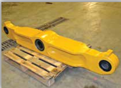
Equaliser bar repairs