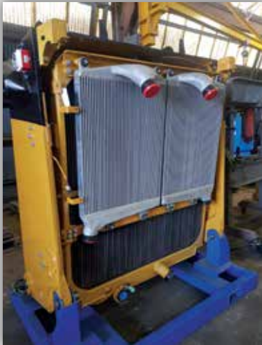
CAT D11T nose cone

OUR AIM IS TO BECOME THE FIRST COMPANY YOU THINK OF WHEN ITS TIME TO GET WORK DONE.