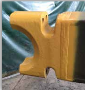
Push arm cap