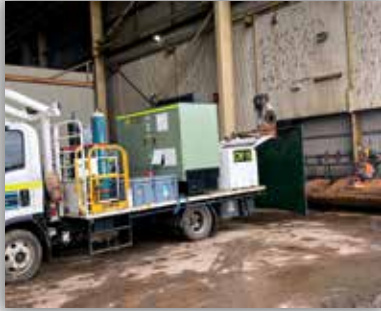
Onsite repairs and fabrication

NATA APPROVED INDEPENDENT NON-DESTRUCTIVE TESTING.