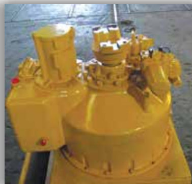
789 Torque converter being dyno tested and QA'd