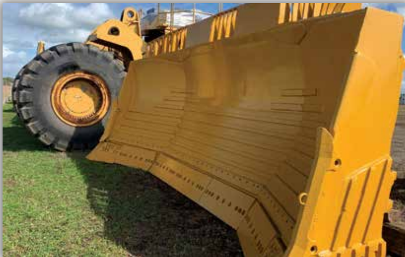
D11 U blade