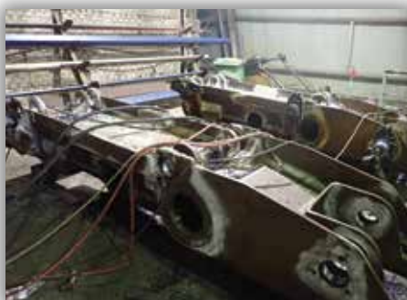
Dozer track frame reclamation and conversions to toe out and straight applications