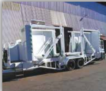
Auto stack pipe trailer manufacture