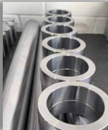
Shaft and brush manufacture