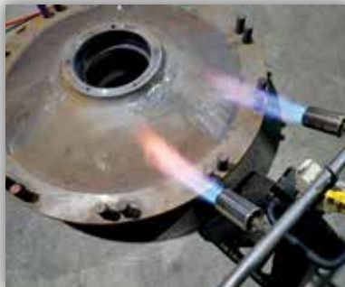
Front hub repair