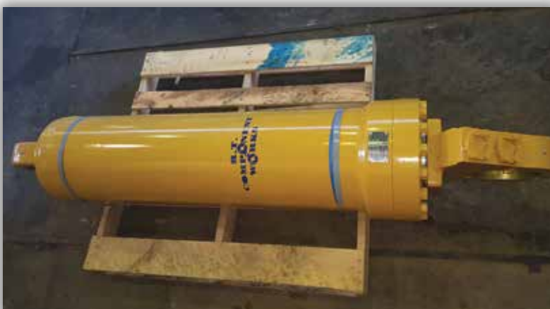
785 Hoist cylinder