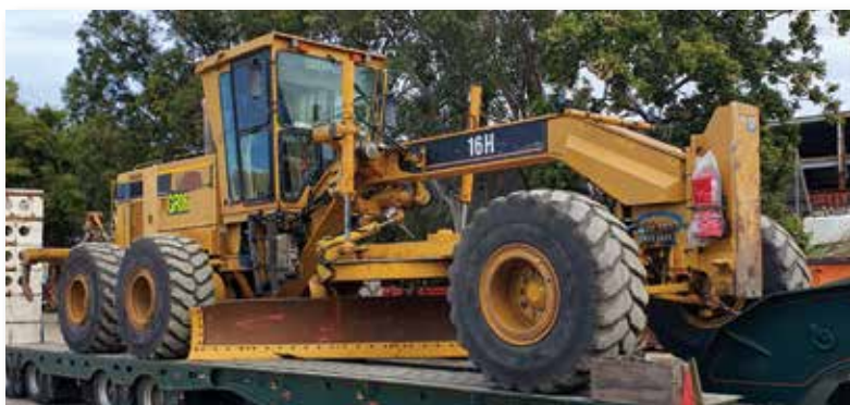
CAT 16H rehouse, rewire, cab overhaul, defect repairs and component changeouts