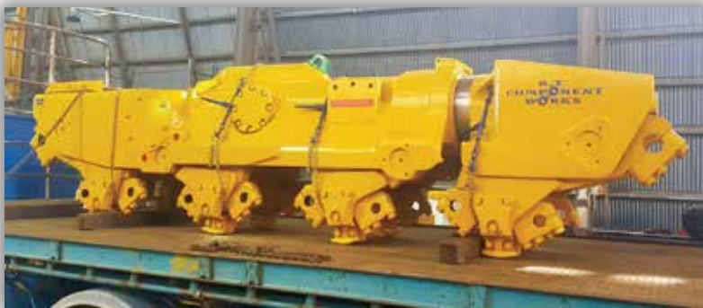
D11T zero houred track frame overhaul