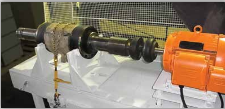
Warmam pump barrels overhauls and testing