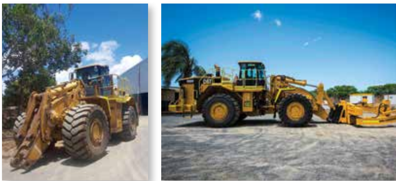
CAT 988H defect repairs, engine supply and change out, blast/paint and 10,000kg tyre handling conversion