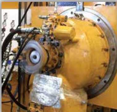
789 Torque converter being dyno tested and QA'd