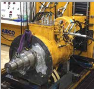
Transmission being tested and adjusted on the dyno. Completed 793 transmission and diff assembly tested and QA'd