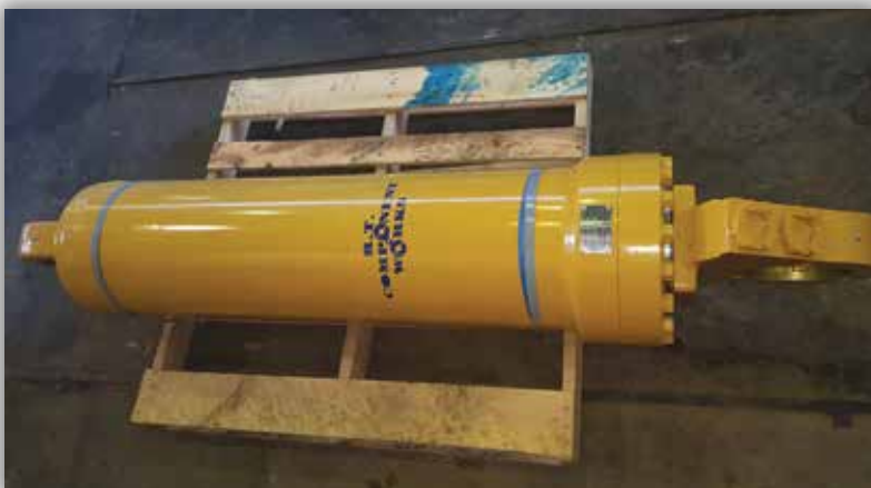
785 Hoist cylinder